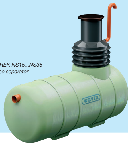
EuroREK NS15...NS35 grease separator