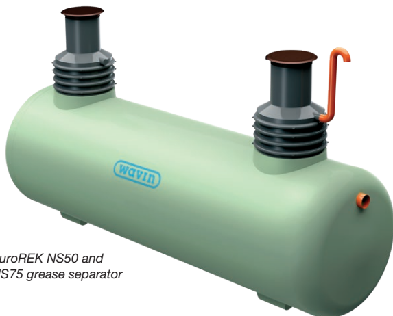
EuroREK NS50 and NS75 grease separator