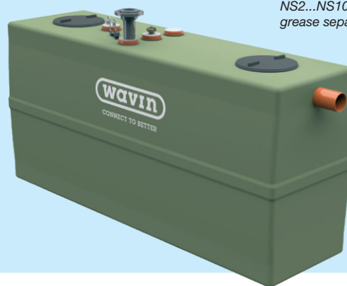
EuroREK SL GRP NS2...NS10 grease separator