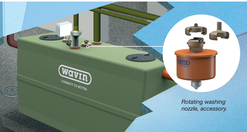
Rotating washing nozzle, accessory.