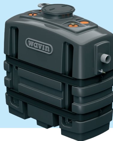
EuroREK NS2...NS7 SL grease separator