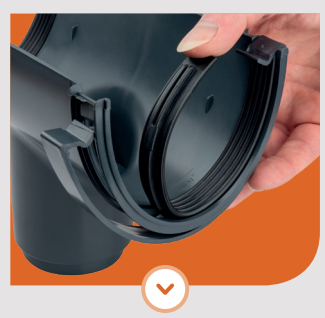
Wide, retained seals