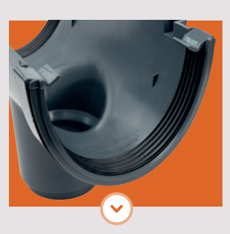
Expansion line and stopper